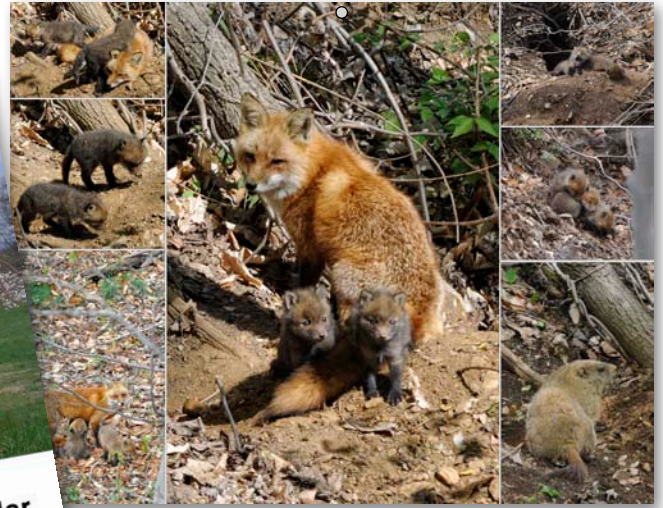
... - In the spring of 2011 and 2012, the Merriwethers on Yellow Springs Road enjoyed front row seats as a mother fox raised two sets of kits (baby foxes) in the steep side-wall of an old quarry immediately behind the Merriwethers' home. In 2011 she had three kits and in 2012 two kits. The excavation of the den yielded a nice level terrace outside the den opening, and all but the lower left photo were taken of the family on this "stoop". The upper-right image shows the opening to the den as seen from the opposite end of the quarry. The middle image on the right shows the three 2011 kits trying to snuggle together on the steep slope above the den. The middle kit seems to be anticipating the group sliding down the slope, an event that happened frequently as the lowest kit inevitably could not gain enough purchase to hold the weight of all three. In 2013 the fox's den was taken over by a neighborhood groundhog (lower-right image).

Available at the Township Office and via mail order forms posted on www.charlestown.org .